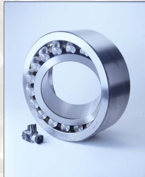
Redhill currently holds in stock SKF Spherical Roller Bearings and Ball Bearings up to 1.5 meters inside diameter