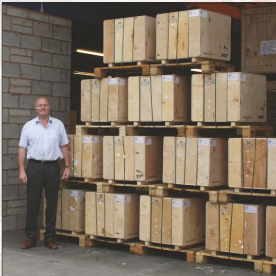
SKF Four-Row Cylindrical Roller Bearings destined for the mining industry in Chile